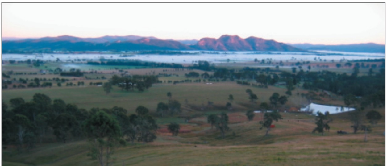
The photograph below highlights the area covered by Exploration Licence 6523 Misty Morning Sunrise – looking northwest across the Avon Valley to the Bucketts Mountains. Gloucester Town is in the mist.

JOIN US. Contact GRIP on 02 6558 9835 or email gripgloucester@gmail.com